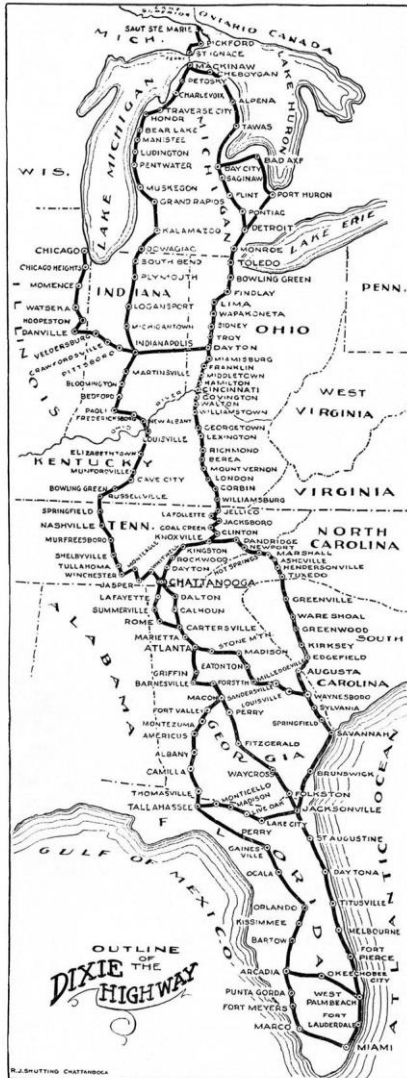
Figure 5 – A 1919 Map of the Dixie Highway.

The Florida Land Boom of the 1920s did not bypass Flagler County as it swept its