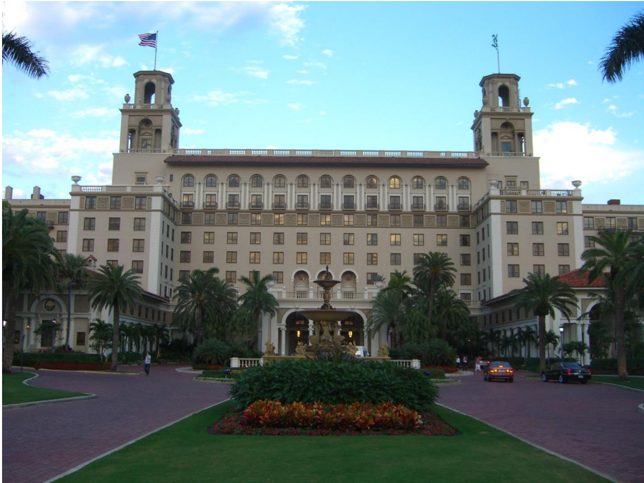
Figure 4 – The Breakers Hotel in Palm Beach is an excellent example of the Mediterranean Revival architectural style.

It did not take long before criminally speculative schemes arose that caused many investors to get defrauded by dishonest people such as the Italian swindler and con artist Charles Ponzi (1882-1949) who took advantage of the situation. Ponzi utilized an unscrupulous and fraudulent scheme (now known as the Ponzi scheme) that lured investors and paid profits to earlier investors by using the funds from newer investors. Ponzi, and other swindlers, also sold mail order building lots that were physically under water.