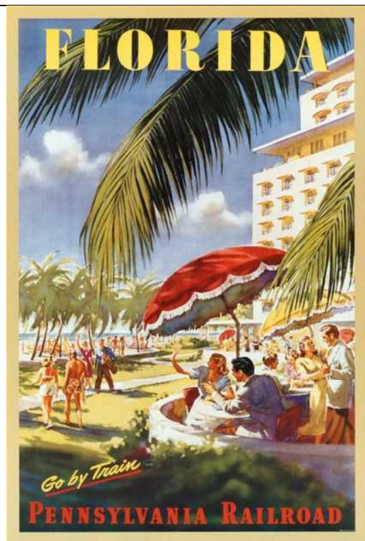
Figure 2 – Tropical Paradise Poster – “Florida - Go By Train - Pennsylvania Railroad” ca. 1925.