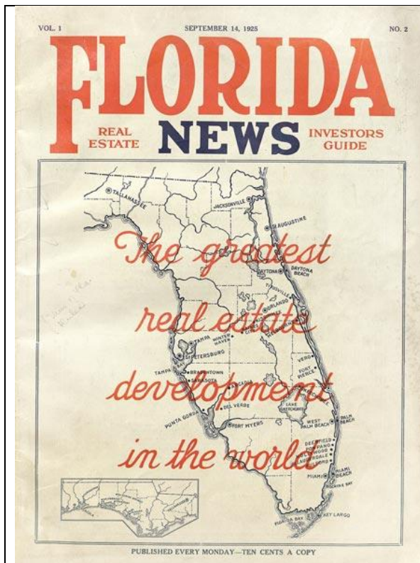
Figure 1 – Florida News – September 14, 1925 – Real Estate and Investors Guide – “The Greatest Real Estate Development in the World”.

Brilliant marketing campaigns ( Figures 1 & 2 ) created ready-made cities that included Coral Gables, Hialeah, Boca Raton and Venice. Hundreds of subdivisions were built within the state and many included alluring and ornate entranceways ( Figure 3 ).