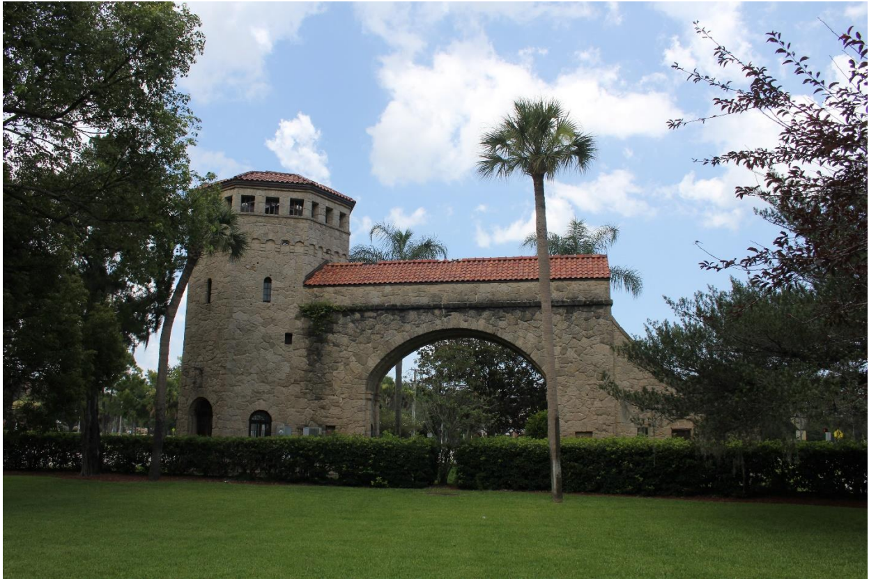
Figure 3 - The Tarragona Tower in Daytona Beach – built in 1925 to serve as a showy and atypical entranceway to the 1000-acre Daytona Highlands Mediterranean Revival residential development (originally called Coquina Highlands).

The Florida Land Boom of the 1920s sparked the Mediterranean Revival architectural style to peak as it blended Spanish, Italian, Mediterranean, Venetian and Gothic details into many structures including lavish hotels ( Figure 4 ), apartment buildings, commercial complexes, mansions and smaller houses.